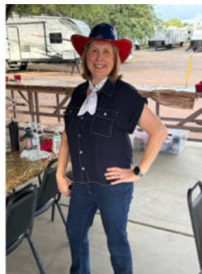
Camptown Races and Twelfth Street Rag.

abounded with cowboy hats, turquoise, and wild rags/bandanas. The vintage piano list played favorites like